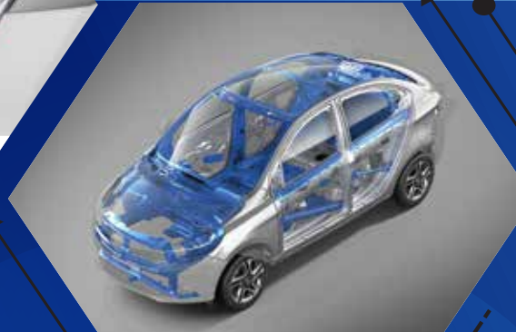
Reliable architecture with cocoon like safety cell