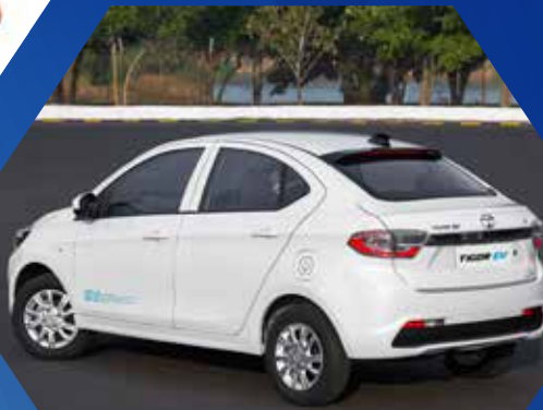
Breakfree coupe - inspired roof line