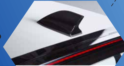
Piano Black shark fin antenna and LED high mounted stop lamp