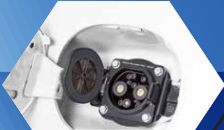
Fast charging socket - 0 to 80% in 120 min*