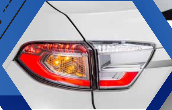
Crystal-inspired LED tail lamps