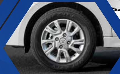
Stylish alloy wheels (Available in XT only)