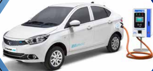
Fast charging socket - 0 to 80% in 120 min*