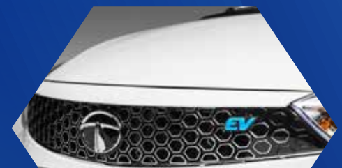
Diamond front grille with chrome humanity line